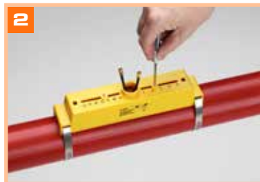
Clamp guide rail and sensor assembly to pipe and release sensor locking screws after adjustment