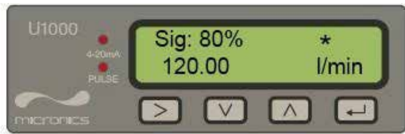
U1000 Flow Reading Screen