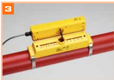
Connect power and sensors to electronic assembly