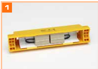
Guide rail and sensor assembly showing grease applied