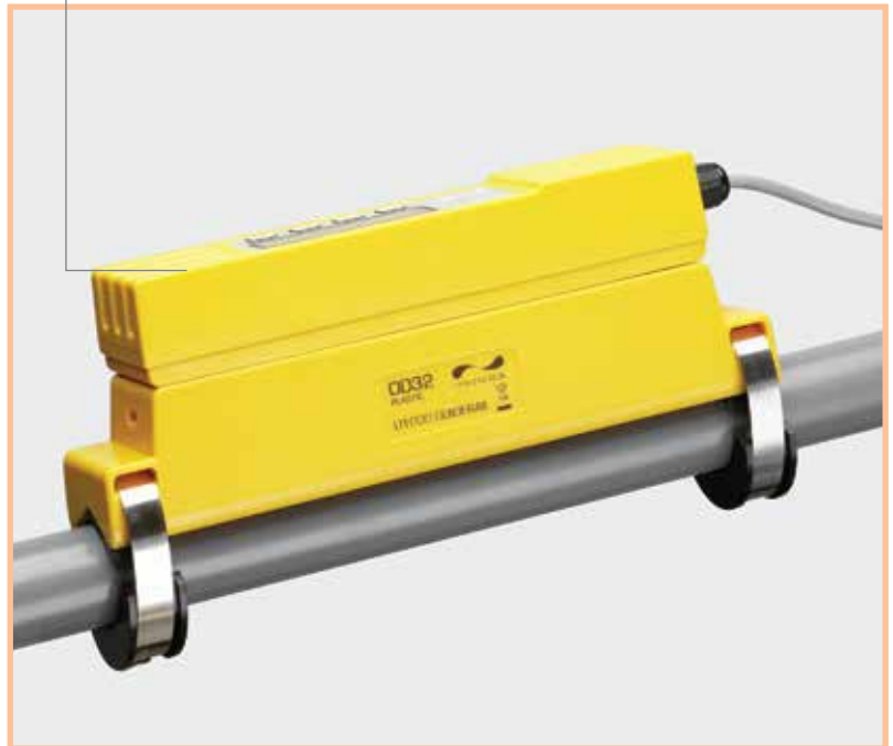
U1000 - Permanent Ultrasonic Liquid Flow Meter