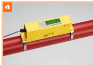
Click electronic assembly onto guide rail and sensor assembly